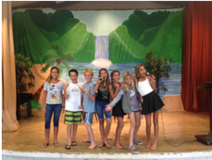
Student Council Members rehearsing for the Quarter I Student of the Week Assembly